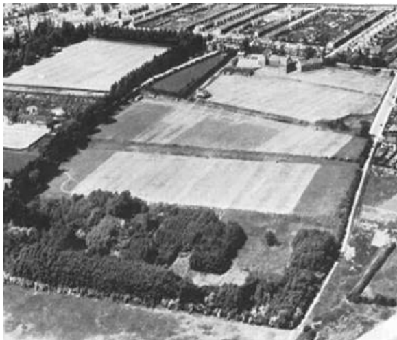
Aerial view of the school grounds at the start of the War